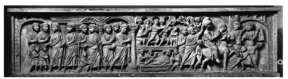
Figure 10.2: Città del Vaticano, Museo Pio Cristiano. Bethesda sarcophagus