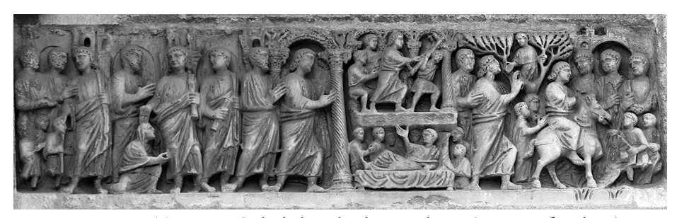
Figure 10.3: Tarragona, Cathedral. Bethesda sarcophagus

gospel events (two scenes of wonder working, Zacchaeus in the sycamore tree, and Jesus' final entry into Jerusalem).