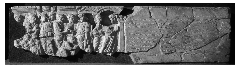
Figure 10.1: Rome, Museo cristiano delle catacombe di Pretestato. The sarcophagus of Bassa.